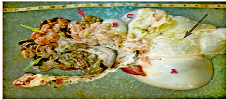
Figure 1: Photograph of the digestive tract of red Sokoto goat, it shows

shown that it consists of three segments that named Duodenum, Jejunum and Ileum (Figure 1). It connects with the large intestine in the lower most part of the alimentary canal which begins with the caecum and ends with the rectum. The entire organ shown to be a musculomembranous structure and elastic throughout its course with slight differences between the segments (Figure 1).